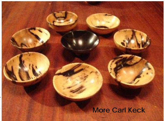
More Carl Keck

Some of the woods are so bad that they need to be stabilized before being able to machine them into a useful item, and that can be expensive if you don't have enough pieces to amortize the minimum cost of this service. People who do the stabilization can do multiple wood species in the same batch, thus keeping your costs down, and once stabilized they will be worked much like the plastic that is used to do the stabilizing. This calls for very sharp tools and finishing to