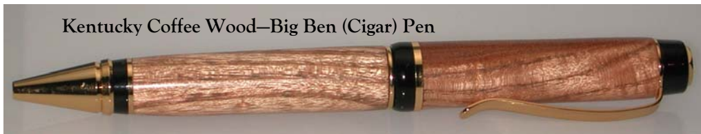
Kentucky Coffee Wood—Big Ben (Cigar) Pen