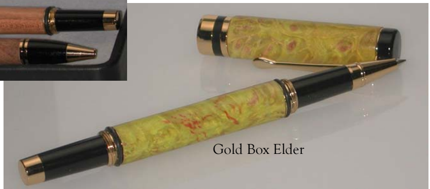
Gold Box Elder