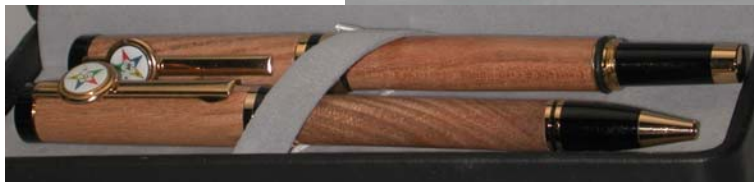
Kentucky Coffee Wood