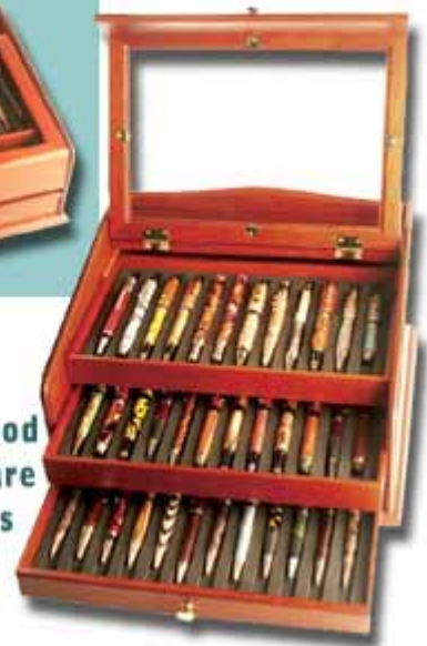
Solid Rosewood Brass Hardware Holds 36 Pens